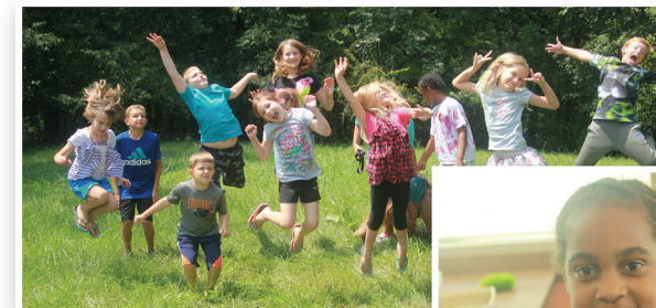
Camp Waves of Emotion 2017