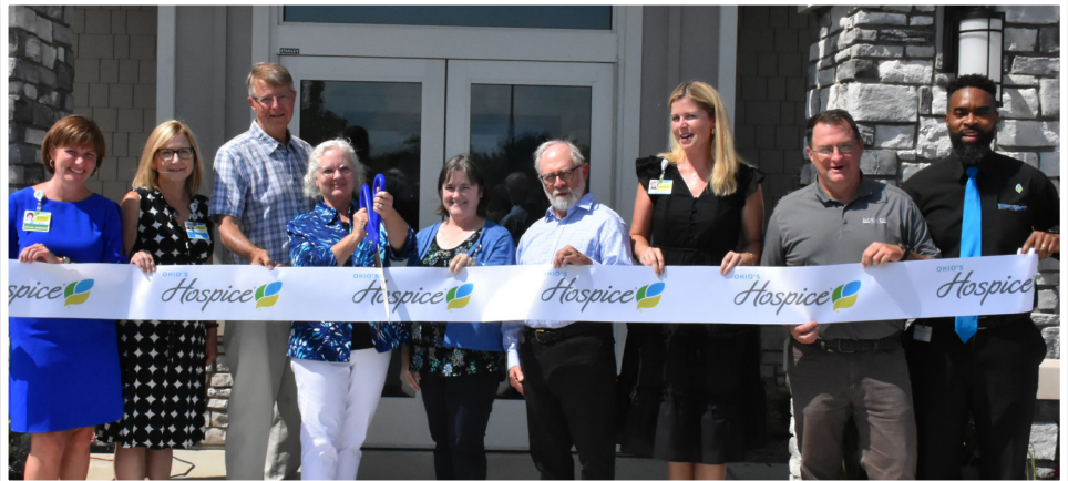
Ribbon Cutting celebrating opening of Marilyn B. and Mark W. Gustafson Center for Supportive Care